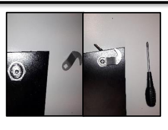
Step 5: Assemble the lock

Mount the lock to the front panel, the latch hook mount to the lock on the backside of the front panel.